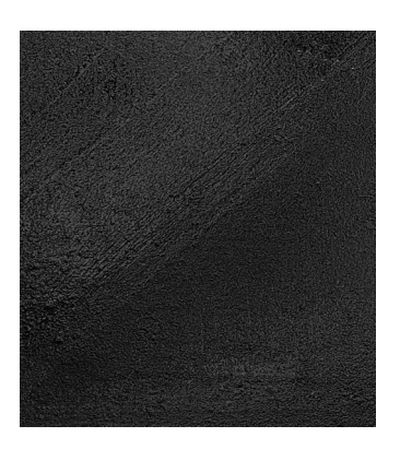
Neutrarust 661® Technology 2 coats - 750 hours salt fog cold rolled steel