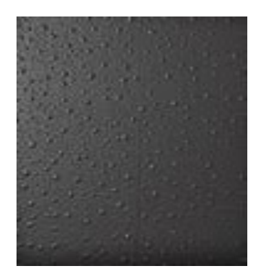
Commercial Benchmark 2 coats - 750 hours salt fog cold rolled steel

After 750 hours exposure Neutrarust 661® has superior cross hatch adhesion performance when compared with commercial benchmark product. On the completion of the exposure the panels were removed, cleaned and photographed. Neutrarust 661® protected the steel panels from highly corrosive salt fog environment. Corrosion damage was minimal to non-existent on the costed panels